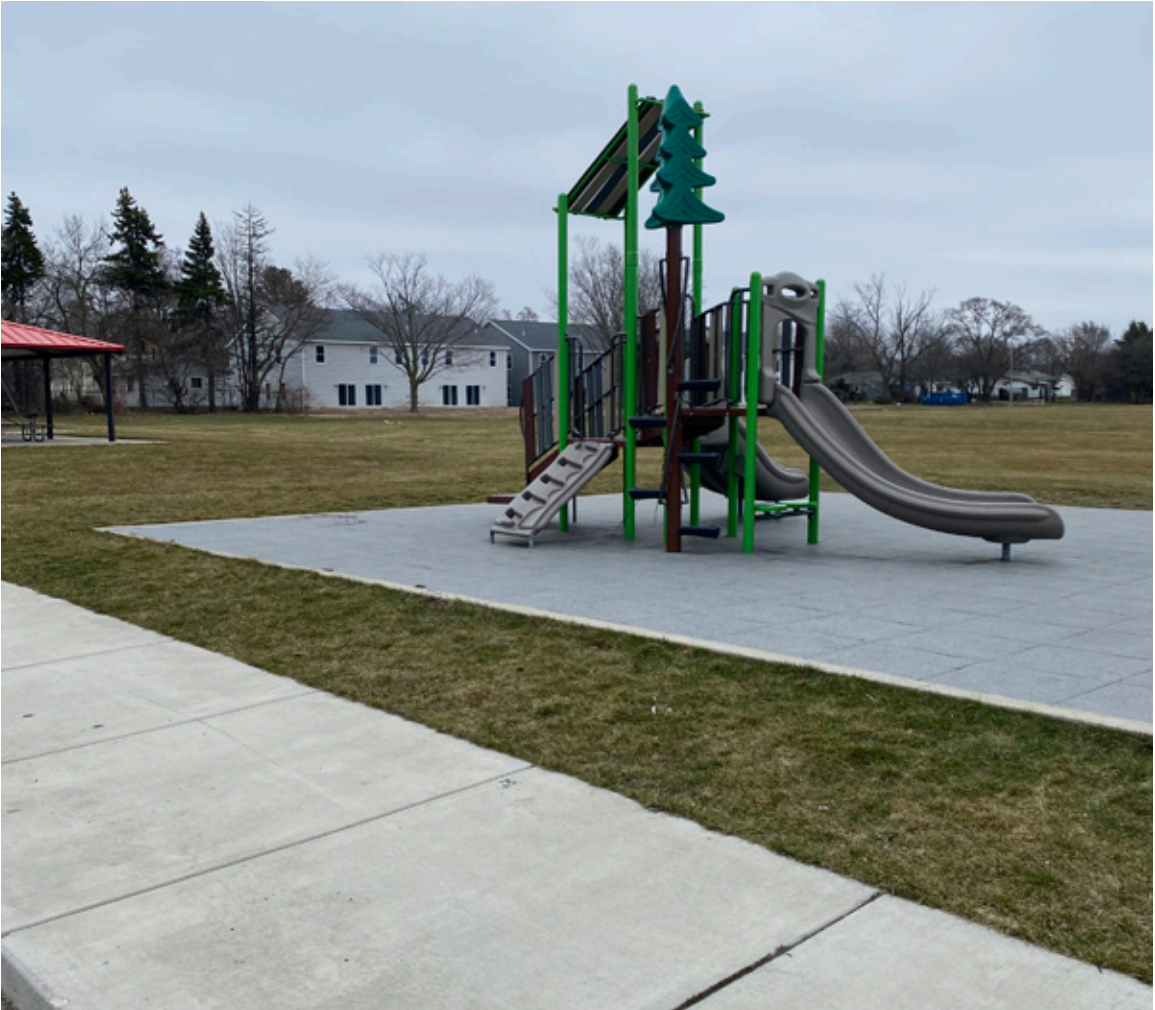
EXISTING PLAYGROUND -Newly replaced playground, lacks diversity of opportunities and is designed for younger children.