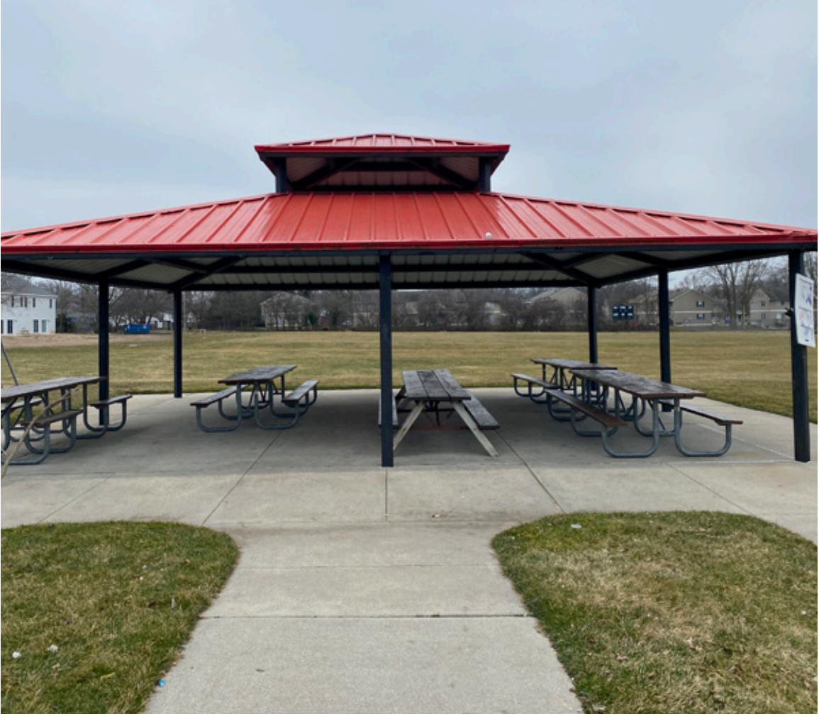
EXISTING SHELTER AND BUILDINGS -Existing structures are in moderate condition and can be reused with minimal updates.