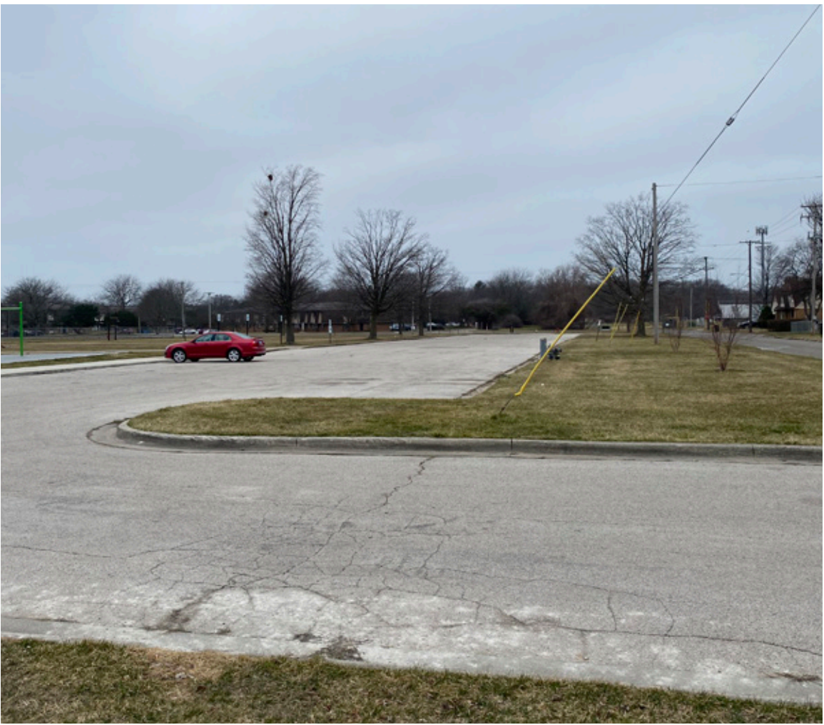
EXISTING PARKING LOT -Paving is in poor condition.