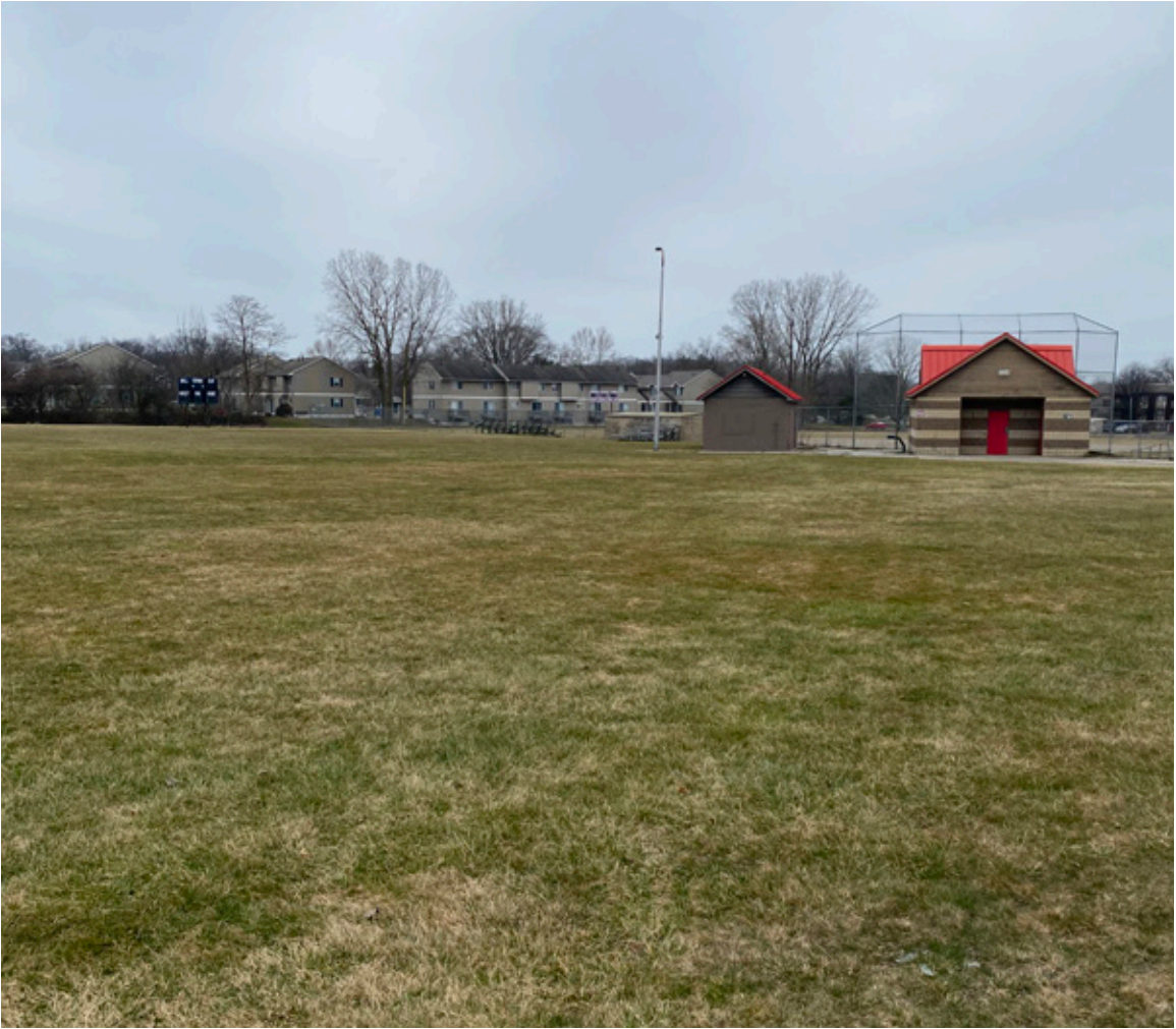
EXISTING FIELDS -Due to soil type, this is not a preferred area for sports fields, therefore other passive recreation options were evaluated.